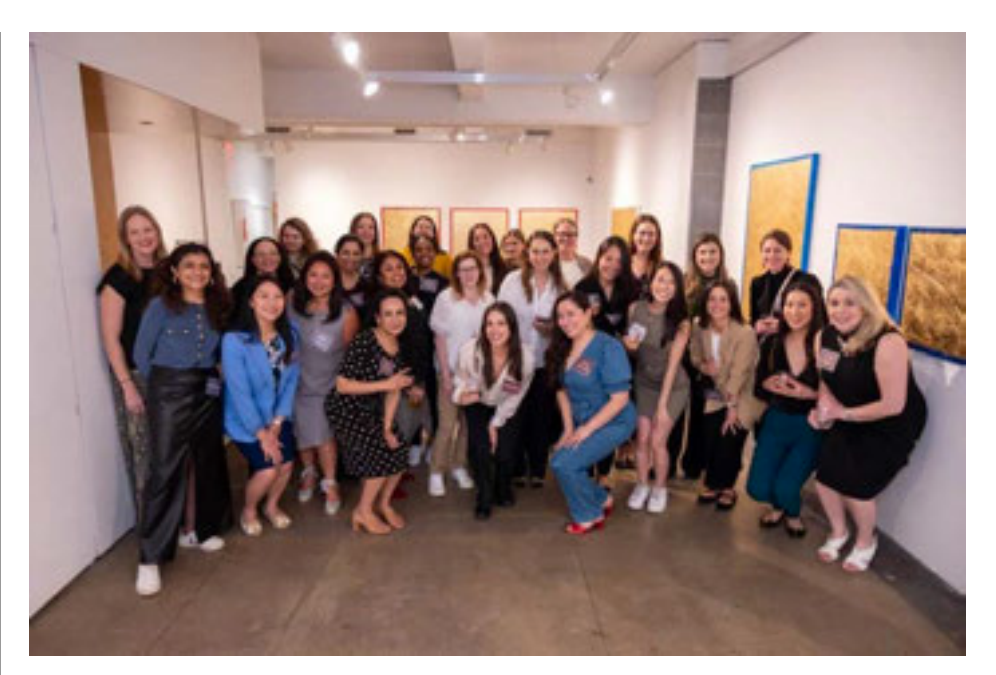
SEI - New York