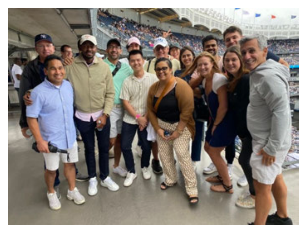
UHY Advisors Northeast